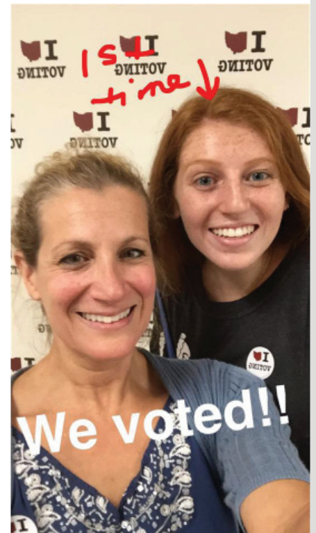
First Time Voter