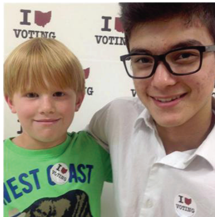
First time voter with his brother who voted a “kids ballot”

On Election Day 72, 042 residents voted at their polling location giving Warren County a 4th place statewide turnout at 78.40%. (State average 71.33%)