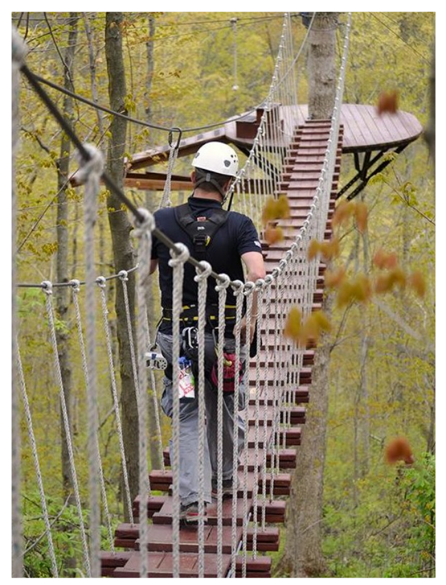
Ozone Zipline Adventures, Turtlecreek Township

The County invests heavily in education and boasts of numerous top school districts in southwest Ohio including William Mason, Kings, and Springboro districts. Many of our high school students earn college credits and associate degrees through Ohio's College Credit Plus programs by attending school at nearby colleges including the University of Cincinnati, Miami University, Sinclair, and Cincinnati State. We have an unwavering commitment to fostering academic excellence and lifelong learning.