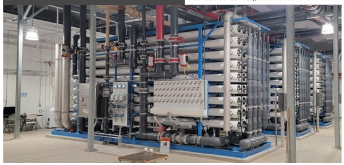
Nanofiltration treatment process at the Richard Renneker Water Plant

Visit www.co.warren.oh.us to download and complete application. Send application along with resume to WCCOMMAPP@CO.WARREN.OH.US.