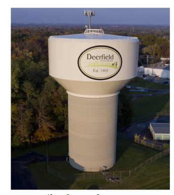
20 Mile Elevated Water Tower

Reporting to the Director and under their general direction, the Deputy will assist with oversight, planning, and administering the operations of the Water and Sewer Department. They will assist with the execution of special projects, meets with community officials, and performs other related duties as required. The Deputy will act on behalf of the