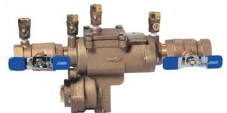
Reduced Pressure Double Check Valve